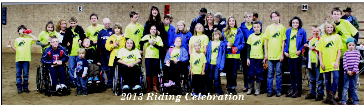
2013 Riding Celebration