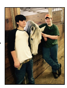
The power of the horse

I am looking forward to our 17th year and sharing more of our amazing 'love' & 'wow' stories with you. Stories of individuals who you directly helped. Your love and your financial support has proven results. You have impacted, transformed and saved lives. The power of the horse, loving volunteers, dedicated staff and YOU are changing lives.